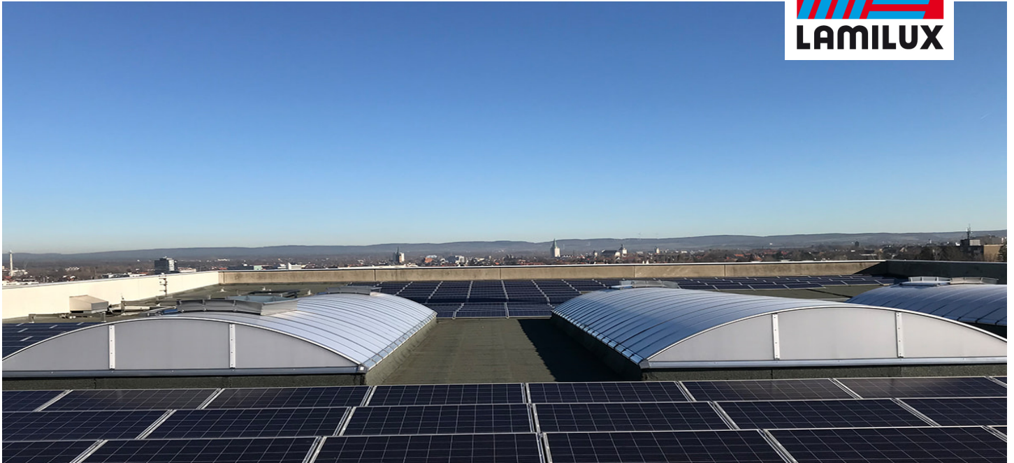
Food factory Stute, Paderborn