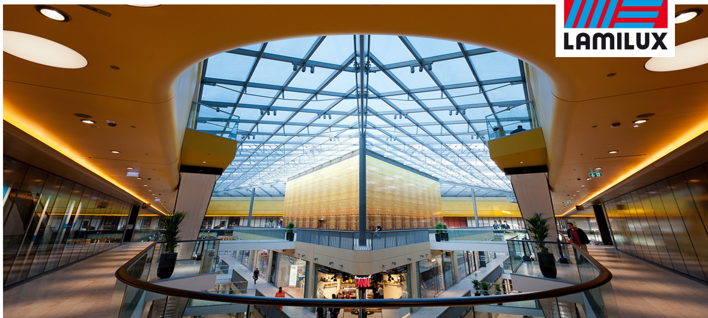
Shopping mall Tier-Galerie, Dortmund