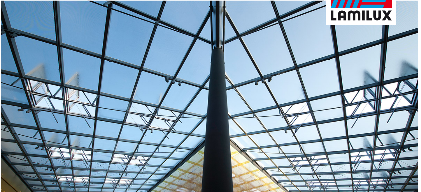
Shopping mall Thier-Galerie, Dortmund