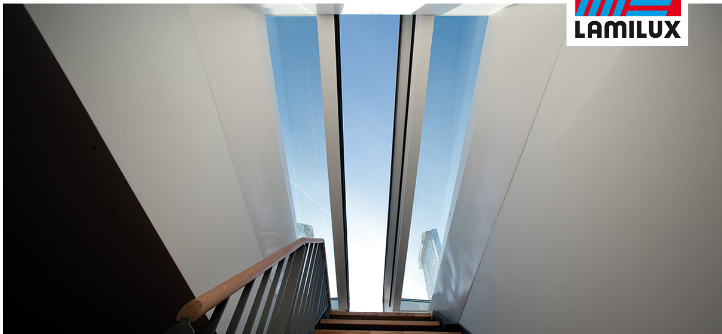
Top floor apartment in the centre of Berlin