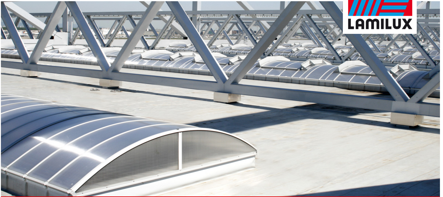
A380 Assembly Hangar